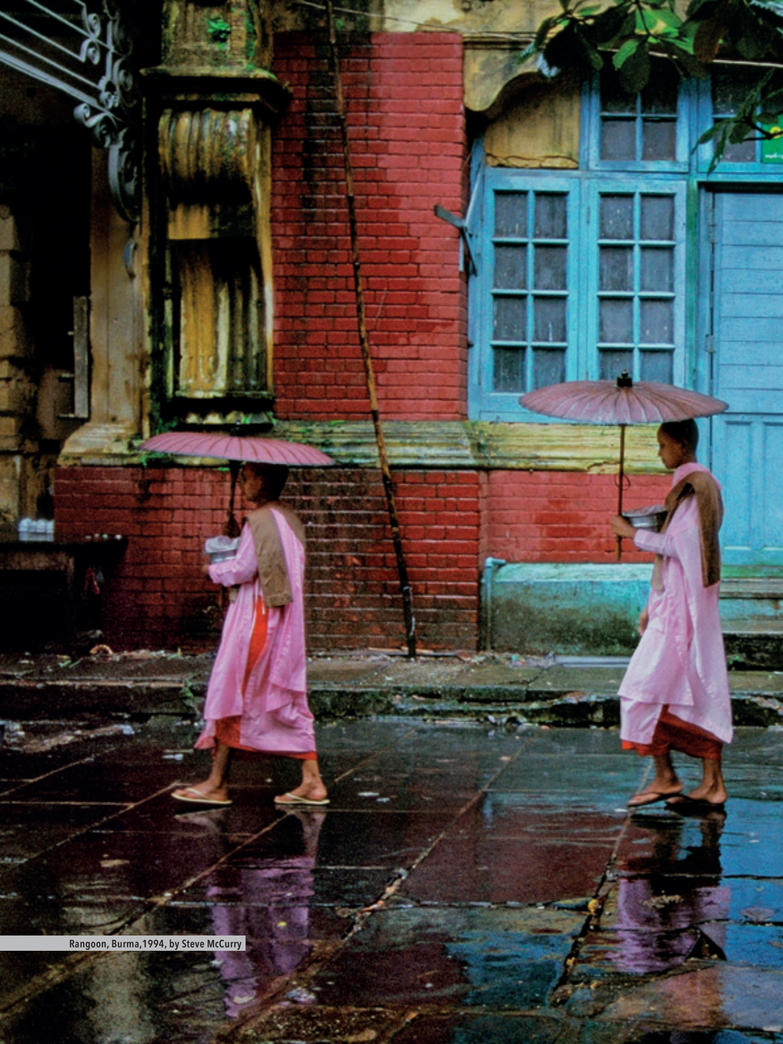
Rangoon, Burma, 1994