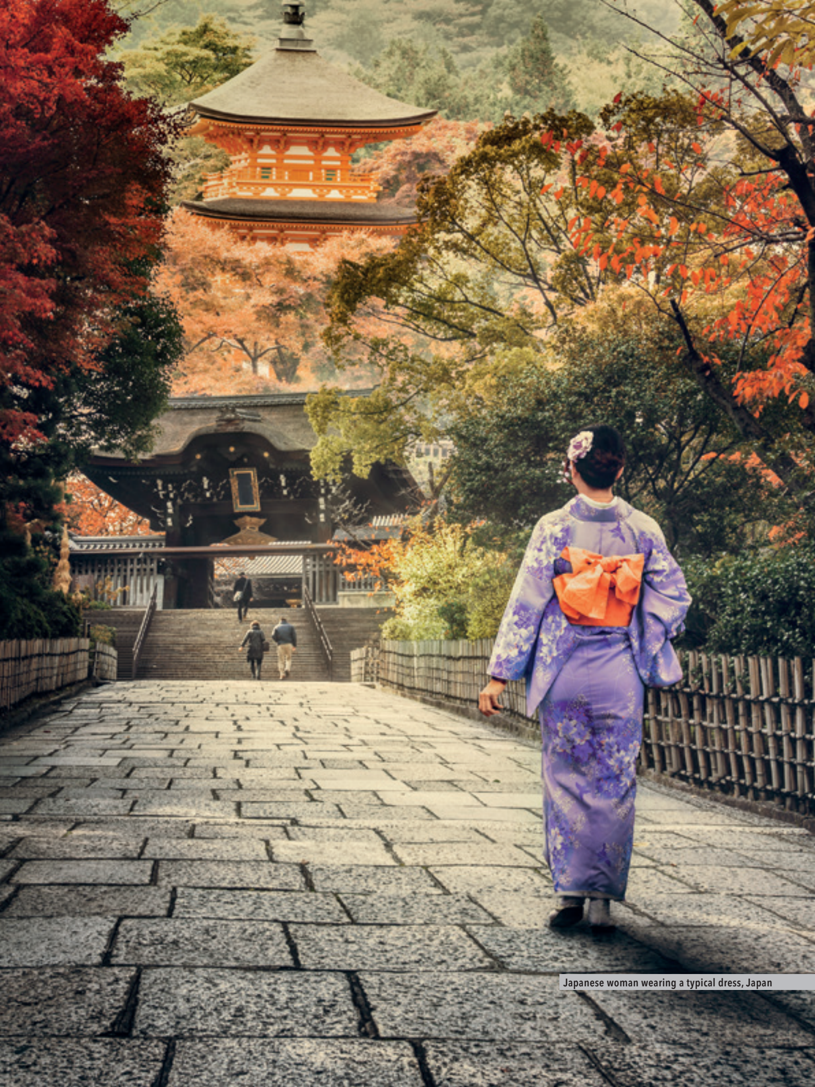
Japanese woman wearing a typical dress, Japan