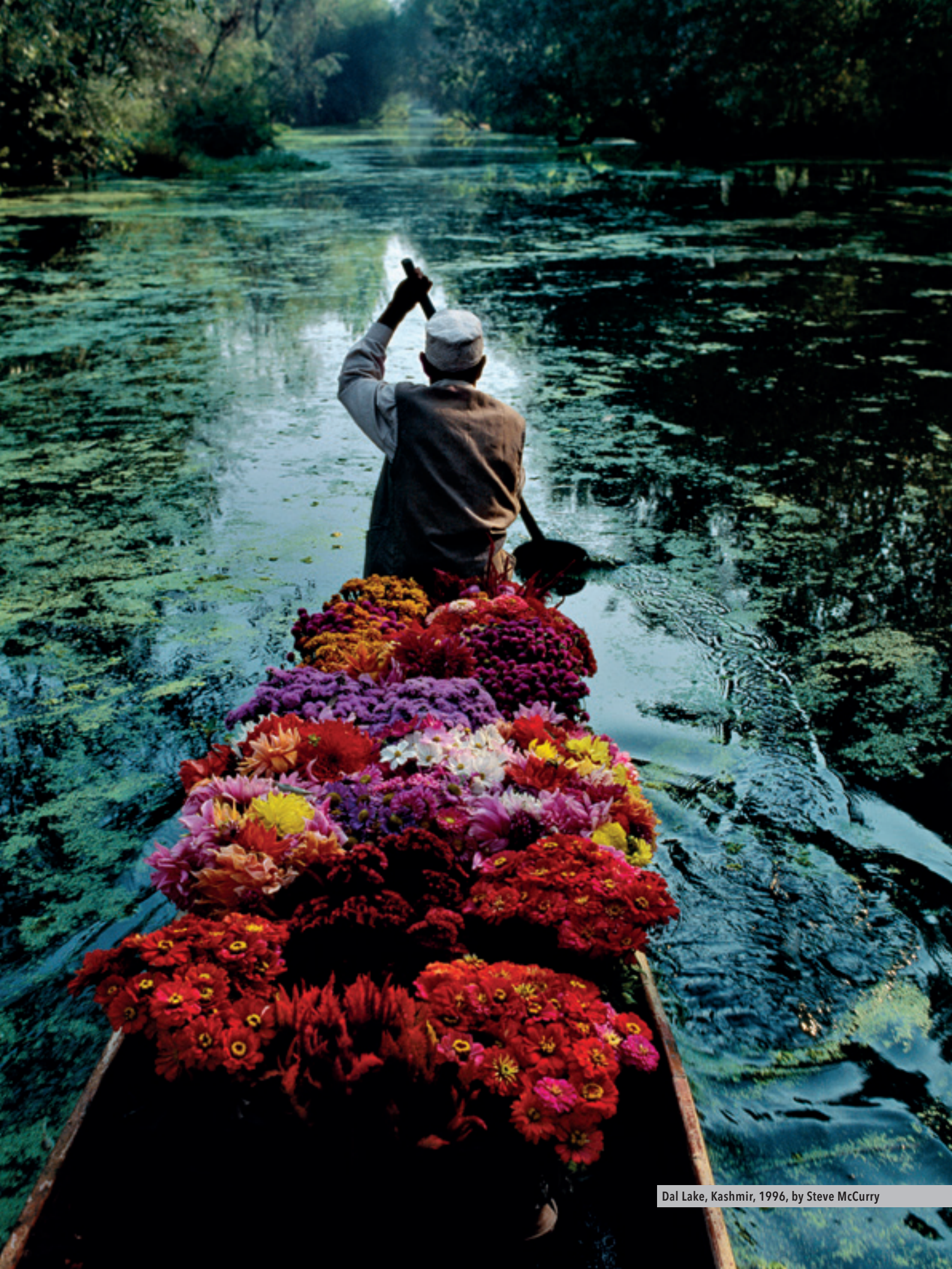
Dal Lake, Kashmir, 1996